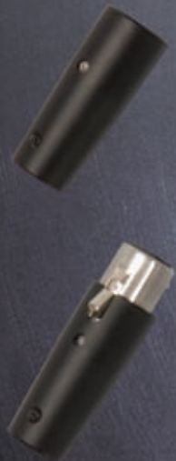
Studio Grade XLR

The design concepts behind this advanced balanced cable began with discoveries regarding earth grounding and its relationship to the signal pair in a differential audio interconnect. This cable employs a dual concentric grounding method along with our unique constrained matrix and orthogonal geometry. The conductor is Hyper-pure, molecularly optimized copper.