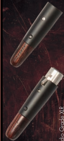
Studio Grade XLR

The KS 2120 is a precision AES/EBU differential digital cable which incorporates Black Pearl silver conductors and Kimber's proprietary digital format. This format creates a cable that is amazingly free of noise, distortion artifacts, and organic in its musical realism.