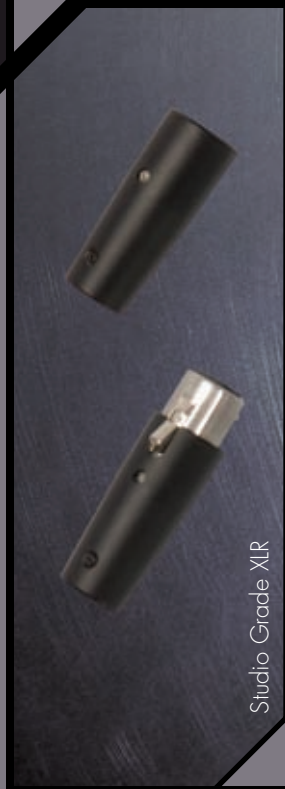
Studio Grade XLR

The KS 1121 uses our constrained matrix in harmony with our orthogonally braided geometry which, along with the Black Pearl silver and Hyper-pure solid core copper conductors, combine to create an incredibly refined balanced cable.