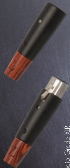
Studio Grade XLR

The KS 1130 is the ultimate in balanced cable technology and performance. Comprised of Black Pearl silver conductors in conjunction with our dual concentric grounding format. The true potential of your balanced equipment will be fully realized with the KS 1130. All aspects of recorded music: soundstaging, harmonic integrity, dynamics (both subtle and great), as well as nuances presented with no limitation or fatigue, are available to those who desire the finest.